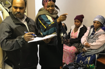
Christian Friends of New Americans celebrate Christmas page 3