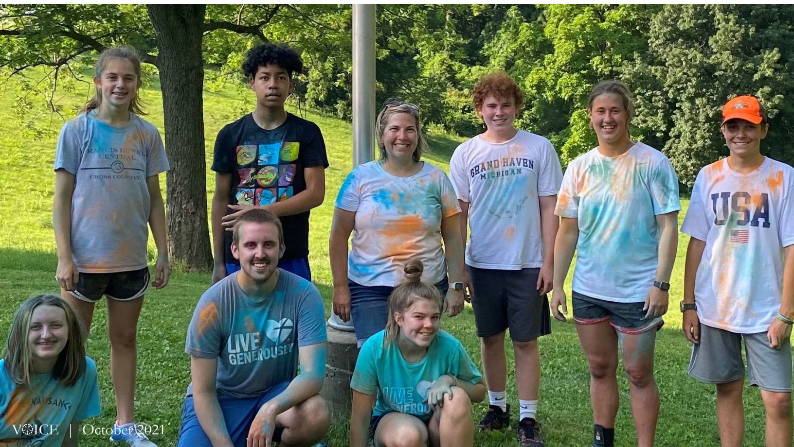
Youth at Immanuel in St. Charles

Your forward-thinking generosity is a source of encouragement to the men and women who will one day serve in our churches and schools. Thank you for walking with them and the future generations they will one day serve.