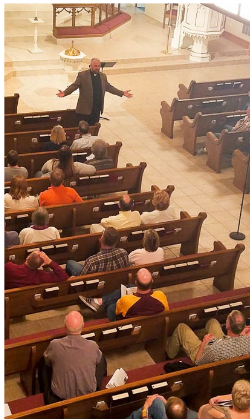
Marriage and Family Conference

It’s important to note, there is no cost to attend the Marriage and Family Conference! For more information visit https://www.marriagefamilyconference.org/