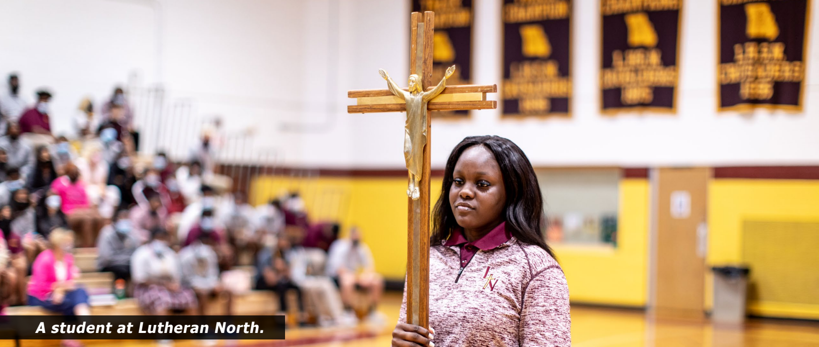
A student at Lutheran North.