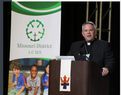
2022 Missouri District Convention moments pictured left and above.